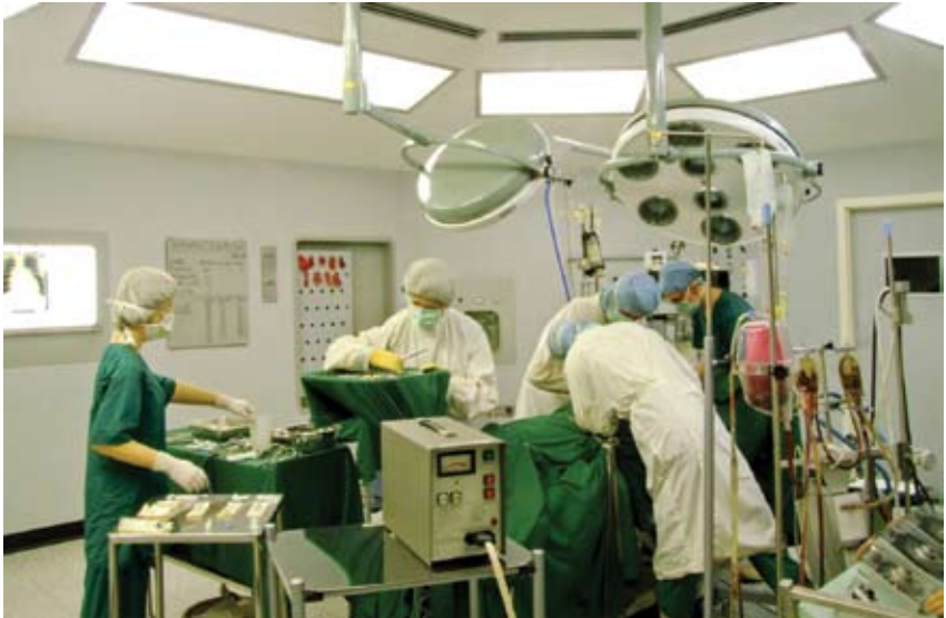
Neurosurgery being performed in an operating theatre.

Neurosurgery involves an operation under general anaesthetic. In this operation, the skull is penetrated (called a 'craniotomy') and the cavernoma is removed. The method used and the risks involved depend on where the cavernoma is in the brain. Surgery for cavernomas has been made safer using the operating microscope (called 'microsurgery'). Brain scanning during the operation allows surgeons to reach cavernomas with as little disruption to the normal brain tissue as possible. This procedure is sometimes known as 'image-guided surgical navigation' or 'computer-assisted or frameless stereotaxy'.