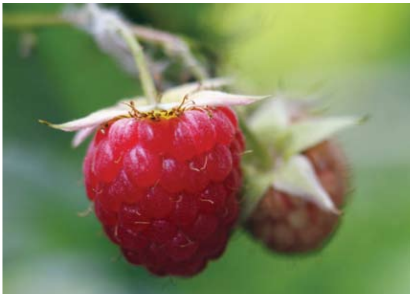
Cavernomas look like raspberries.

Cavernomas are clusters of abnormal blood vessels. Cavernomas are found in the brain, brainstem, spinal cord and, rarely, in other areas of the body.